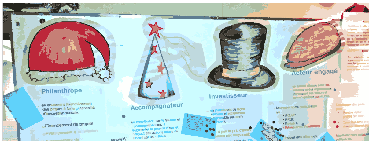
This photo was taken at the Foundation's general assembly in December 2014. The picture illustrates the four avenues in which the Béati Foundation is involved.